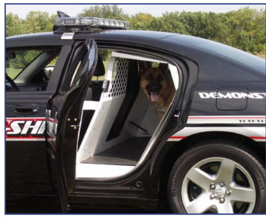
Dodge Charger K9 Kit (KK-K9-D23-K)